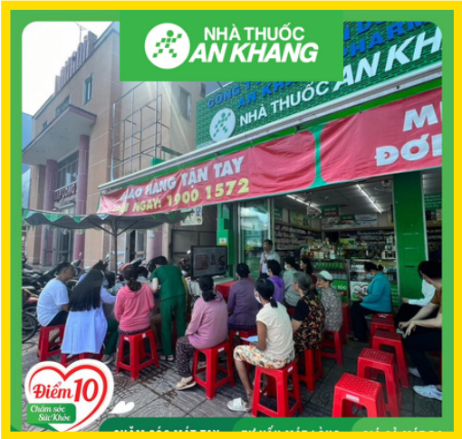
An Khang Pharmacy Hosts Hypertension Seminar For Customers