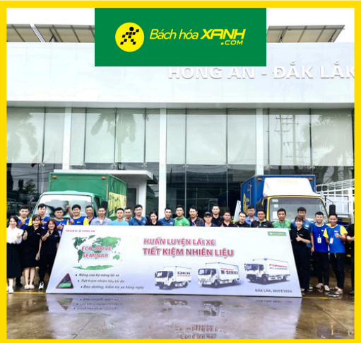
Training Drivers On Fuel Efficiency, Emission Reduction