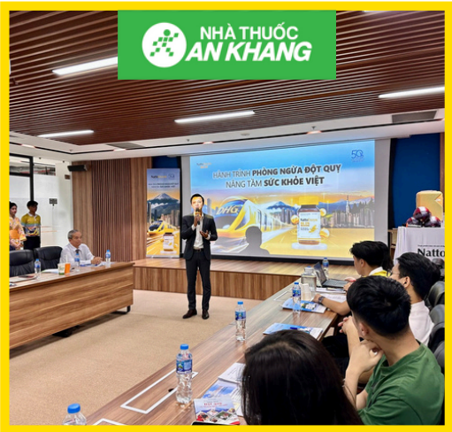
Stroke Prevention Workshop At MWG Headquarters