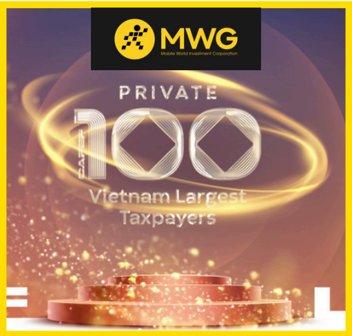
Mobile World Group Ranks Among Top 30 In Private 100 Vietnam Largest Taxpayers