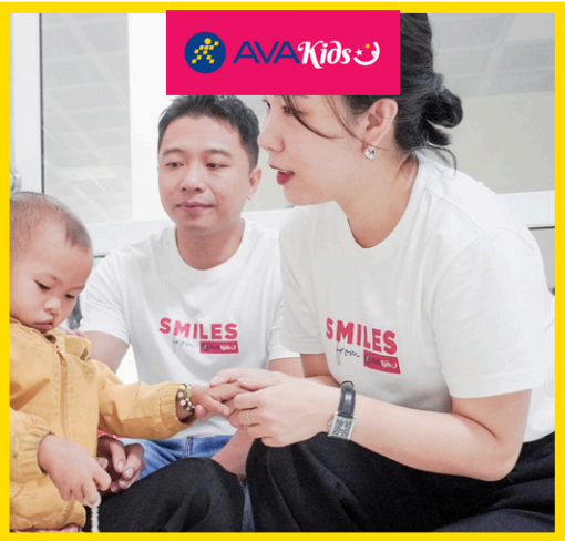
Continuing The Journey Of The “AVAKids Smile Foundation” In Sơn La