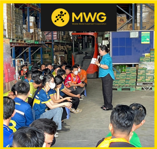
2024 Back-to-School Support Program