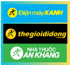
Internal charity run program

On September 4, 2025, An Khang Pharmacy and Opella officially signed a strategic partnership agreement with the goal of “ Commitment to quality, safe products with transparent origins – Accompanying the health of Vietnamese people. ”